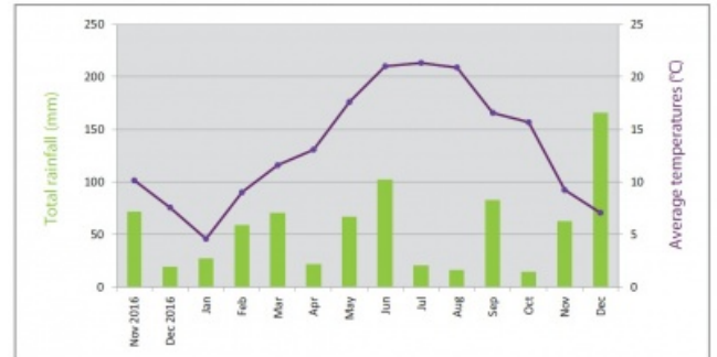
Pluviométrie et températures en 2017